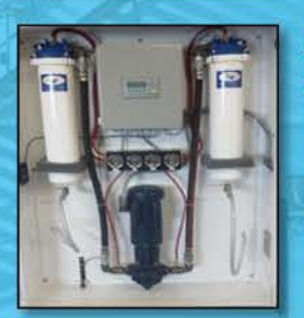
AFS-DDS-3-VF62 20 GPM